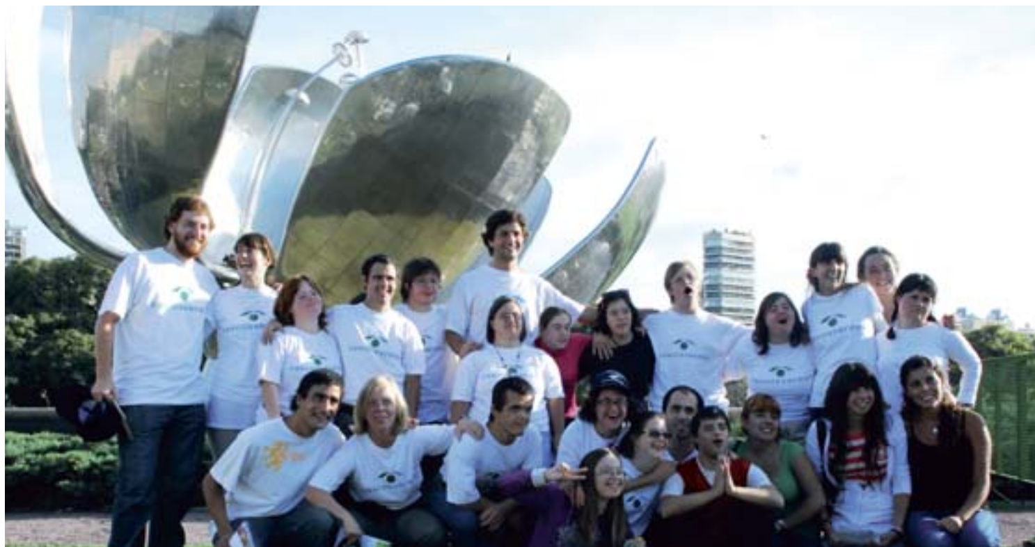
Cascos Verdes, Argentina