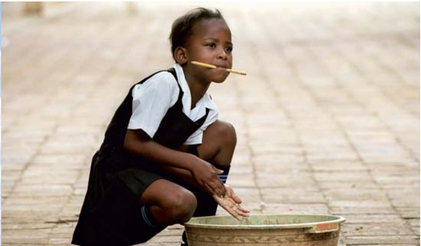
FXB International, South Africa