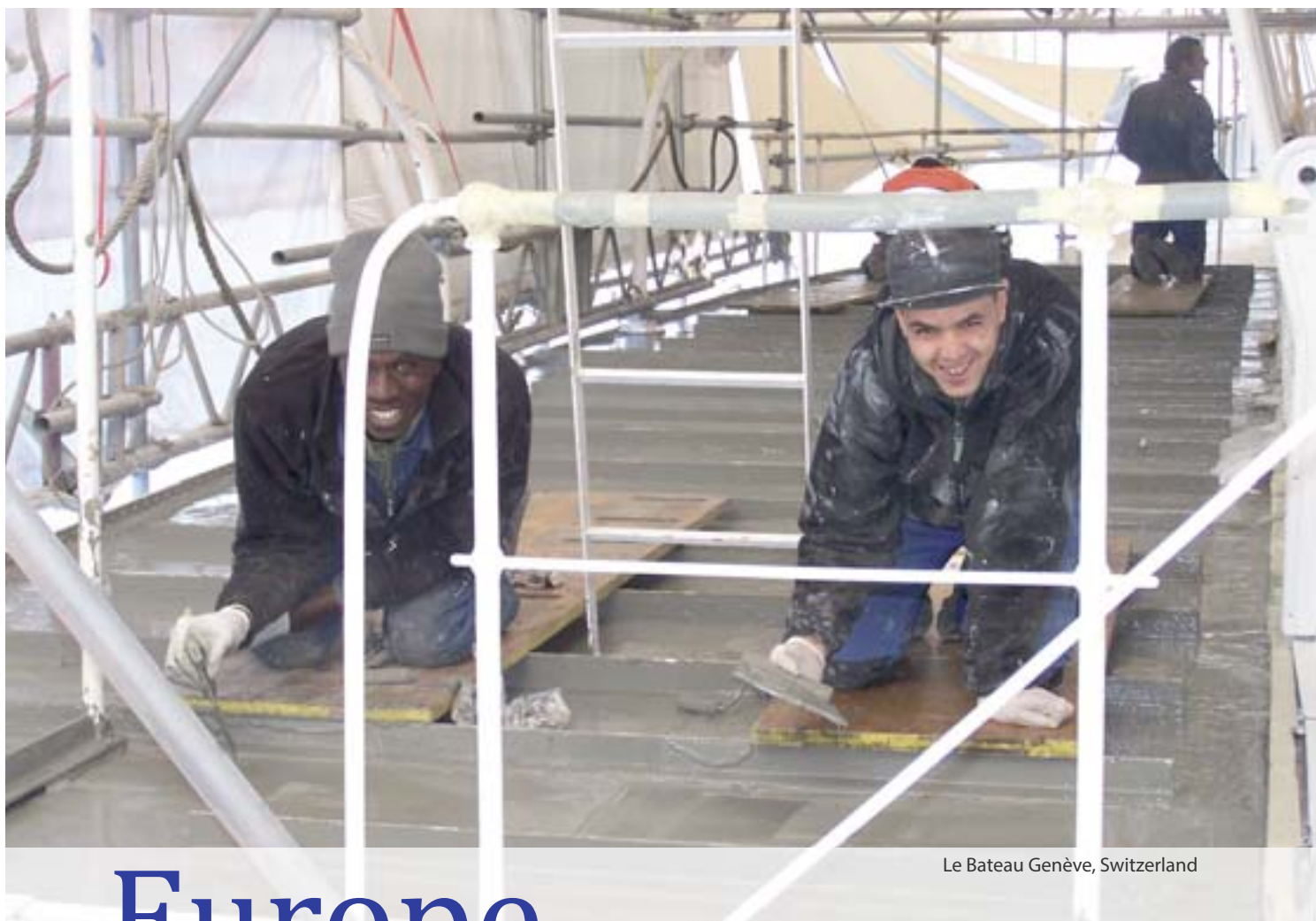
Le Bateau Genève, Switzerland