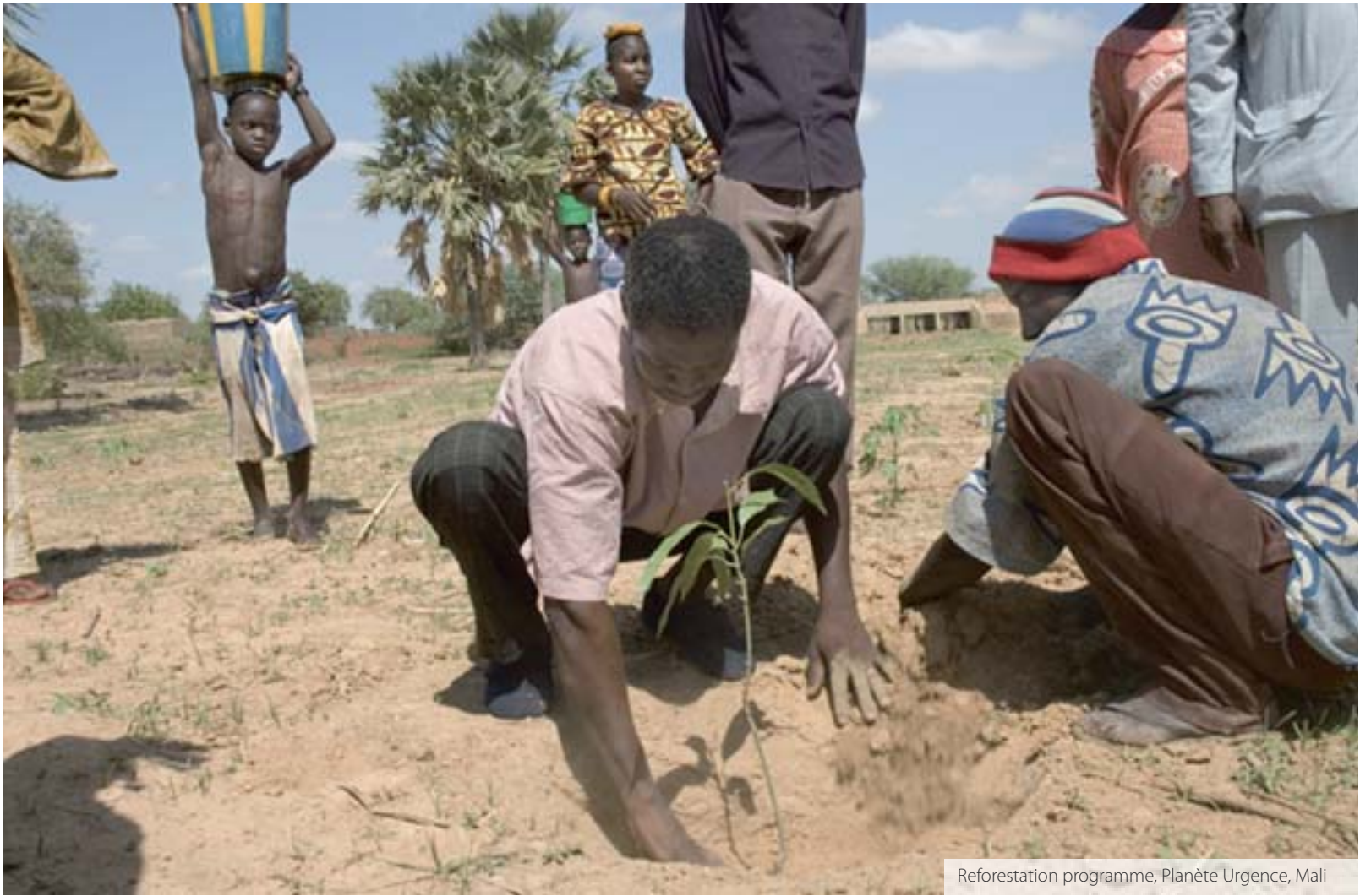
Reforestation programme, Planète Urgence, Mali