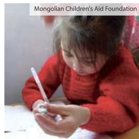
Mongolian Children's Aid Foundation

The Foundation has been supporting the Mongolian Children's Aid Foundation (MCAF) since 2009, the year when MCAF started building a children's centre in Gachuurt, in the outskirts of Mongolia's capital, Ulaanbaatar. MCAF's vision is that every child deserves a home with a warm bed, a warm meal and a proper education. The Gachuurt centre, which was finished in January 2012, houses a school, a library and play rooms. There is enough room for 90 orphaned, abused or abandoned children who have all moved in at the time of writing. The Foundation is very proud and happy to have seen this construction project through, despite extremely harsh weather and economic conditions in the country. The official inauguration of the Gachuurt Centre is planned on 1 June 2012.