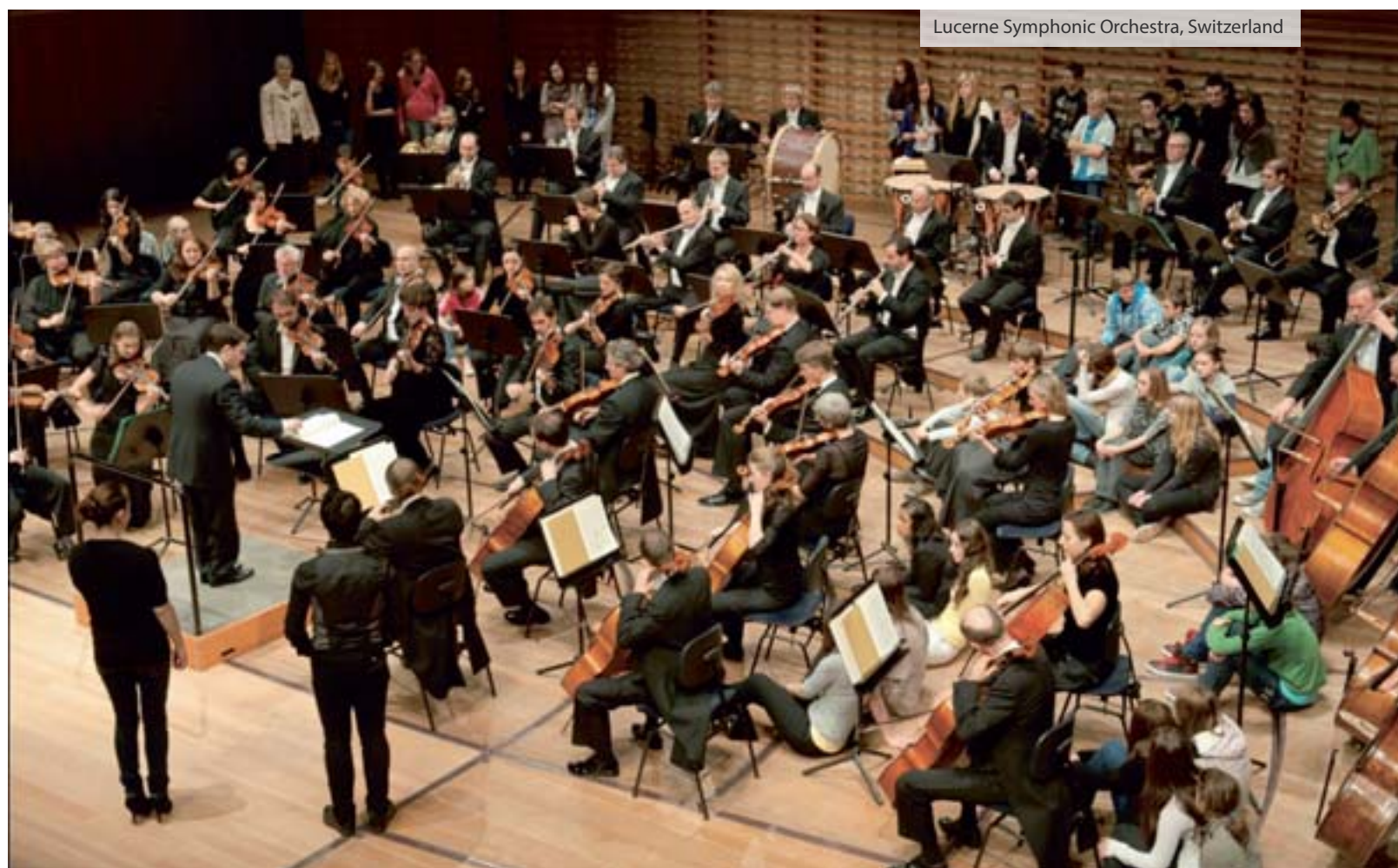
Lucerne Symphonic Orchestra, Switzerland

Each year, Trafigura's London Charity Committee (LCC) organises a vote for the London office staff to choose who their preferred local charity is. The Trafigura Foundation pledges to make a donation to the "Charity of the Year" in exchange of which it asks that the LCC proactively encourages London office employees to participate in the activities of the chosen charity. The Foundation is also involved upstream in validating the list of nominated charities put forward for the vote to make sure they abide by the Foundation's criteria. In 2011, the winner was 'Mousetrap', an arts organisation that works with young people with limited means or opportunities in London and sets up theatre projects. Mousetrap takes approximately 12,000 young people to see a top London production each year. It enhances that experience with education programmes in schools and communities, using theatre as a tool to explore ideas, learn new skills, develop creativity and offer new perspectives.