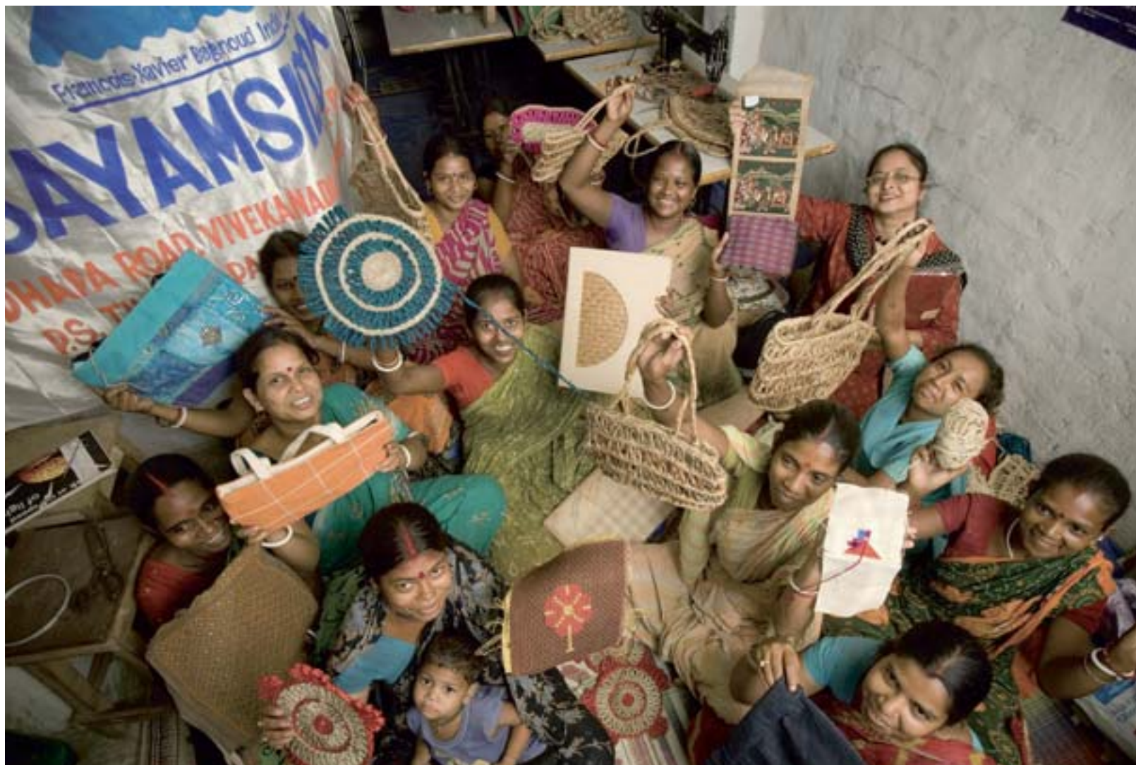
FXB, India.