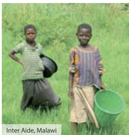
Inter Aide, Malawi

villagers were trained on hygiene best practice and water-related disease prevention. 27 public water points were built or rehabilitated, supplying water to over 1,600 families. In addition, 255 families improved their living conditions by building latrines and an impressive 2,750 water pumps were repaired by local repairers, guaranteeing access to water for 165,000 families.