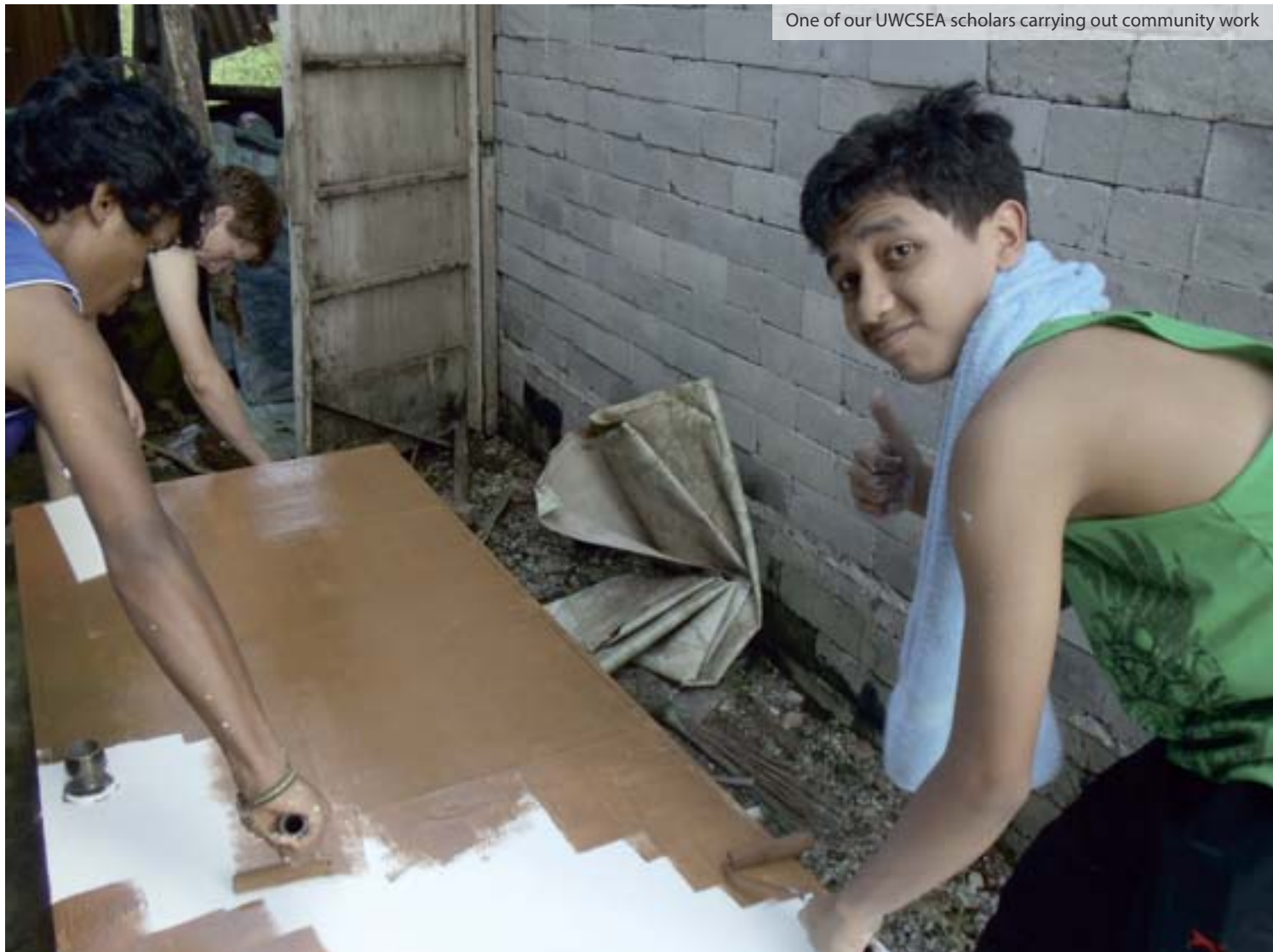
One of our UWCSEA scholars carrying out community work

To read about the water sanitation programme run by Eau & Vie in the Philippines and Bangladesh, go to 'Highlights' on page 6.