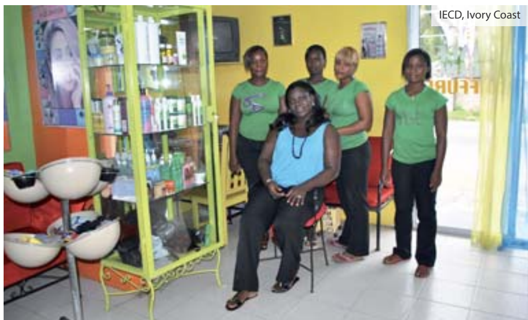
IECD, Ivory Coast

In partnership with a health research and information centre in Togo (CRIPS-TOGO), Initiative Développement (ID), a Paris-based NGO, has been working to combat HIV/AIDS and STDs in Lomé and Noépé, Togo, since 2006. The centre takes charge of people living with HIV/AIDS and supplies them with medicine, psychosocial support and food. It is worth mentioning that access to antiretroviral drugs is free in the centre.