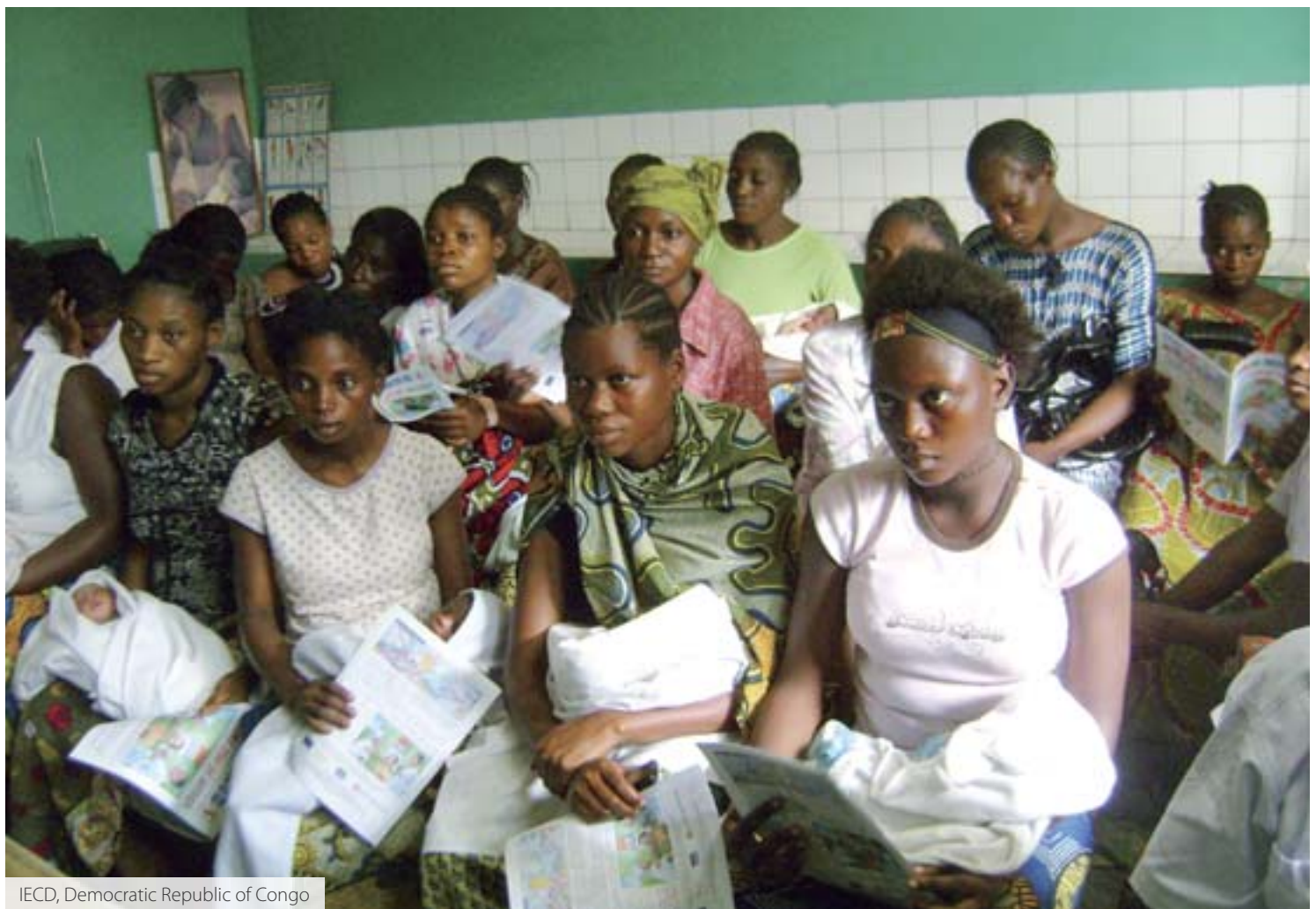
IECD, Democratic Republic of Congo