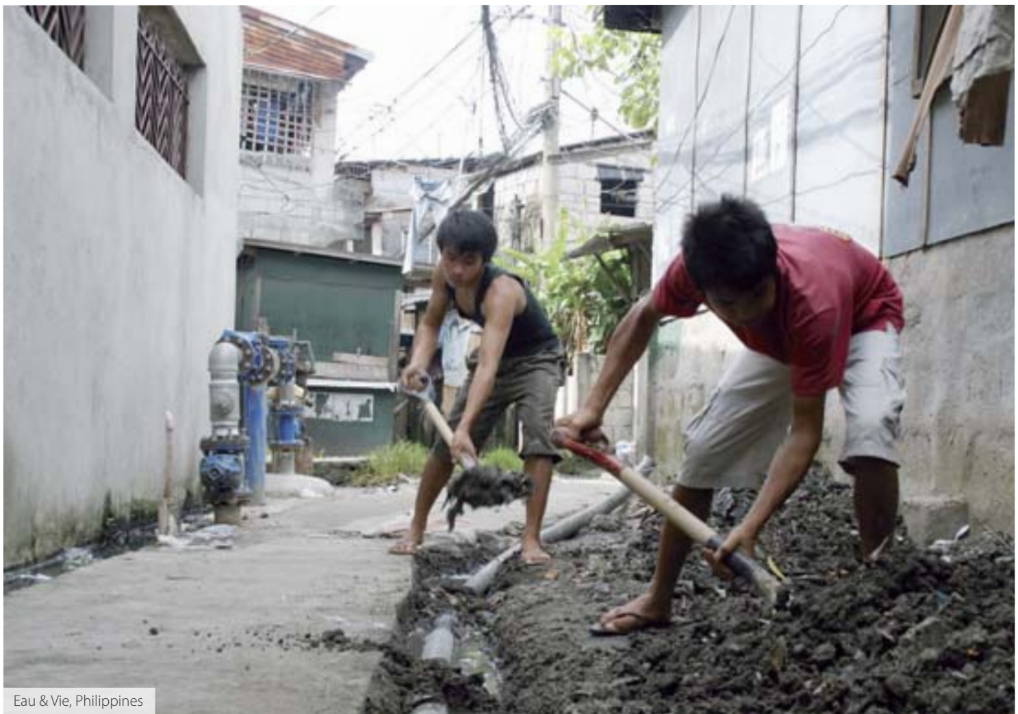
Eau & Vie, Philippines