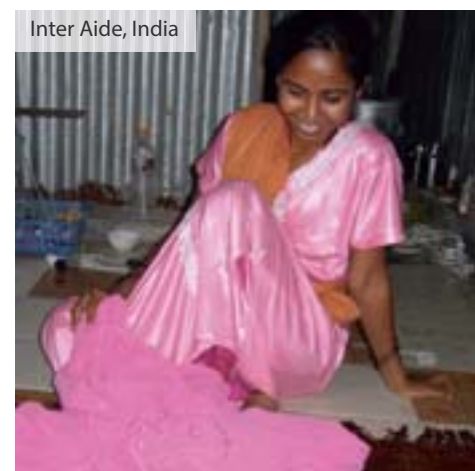
Inter Aide, India