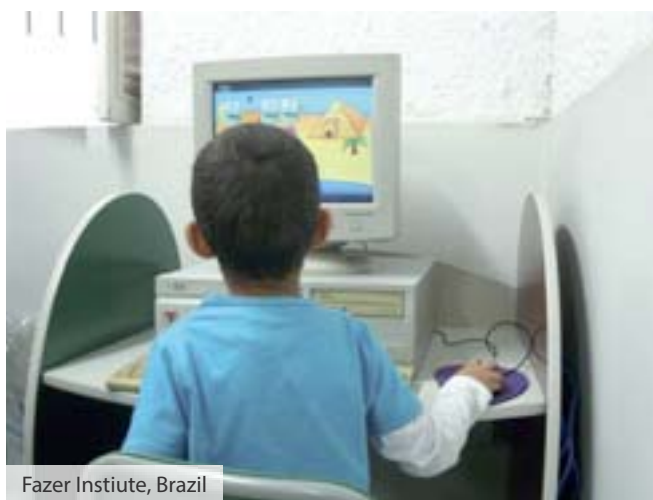
Fazer Institute, Brazil