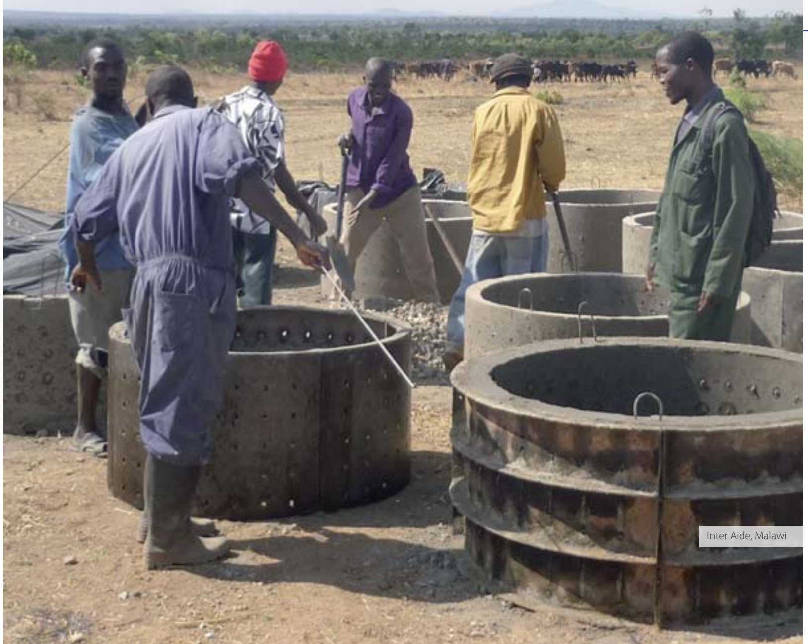
Inter Aide, Malawi

In terms of the quality and impact of selected programme and partners, sustainability is the key. The Foundation consistently strives to identify a reliable operator to run and maintain programmes, no matter where and what they are.